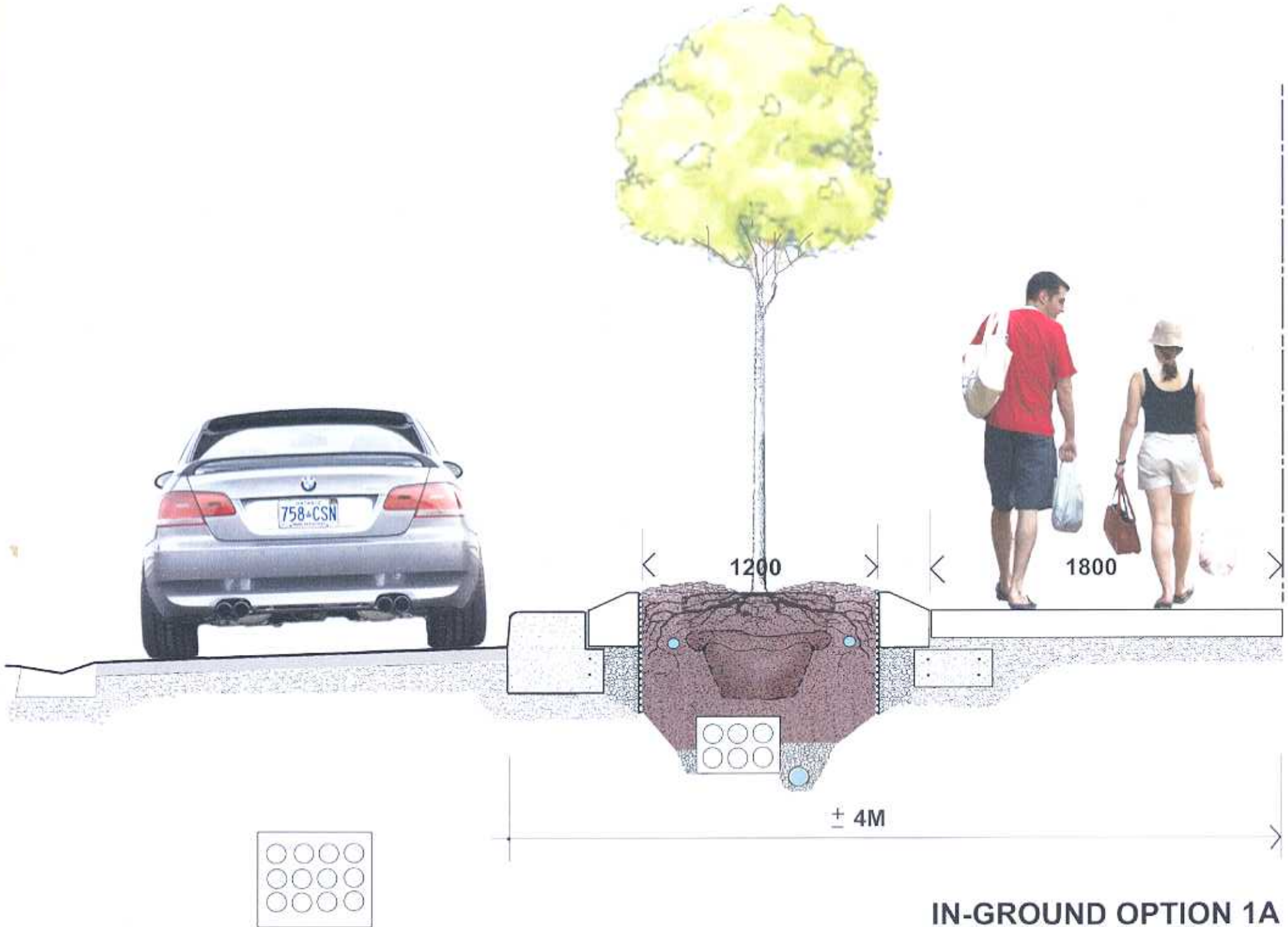
IN-GROUND OPTION 1A